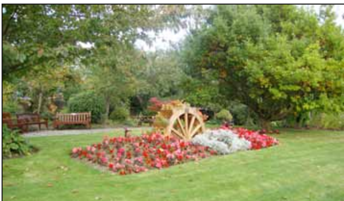
Morton Village Institute